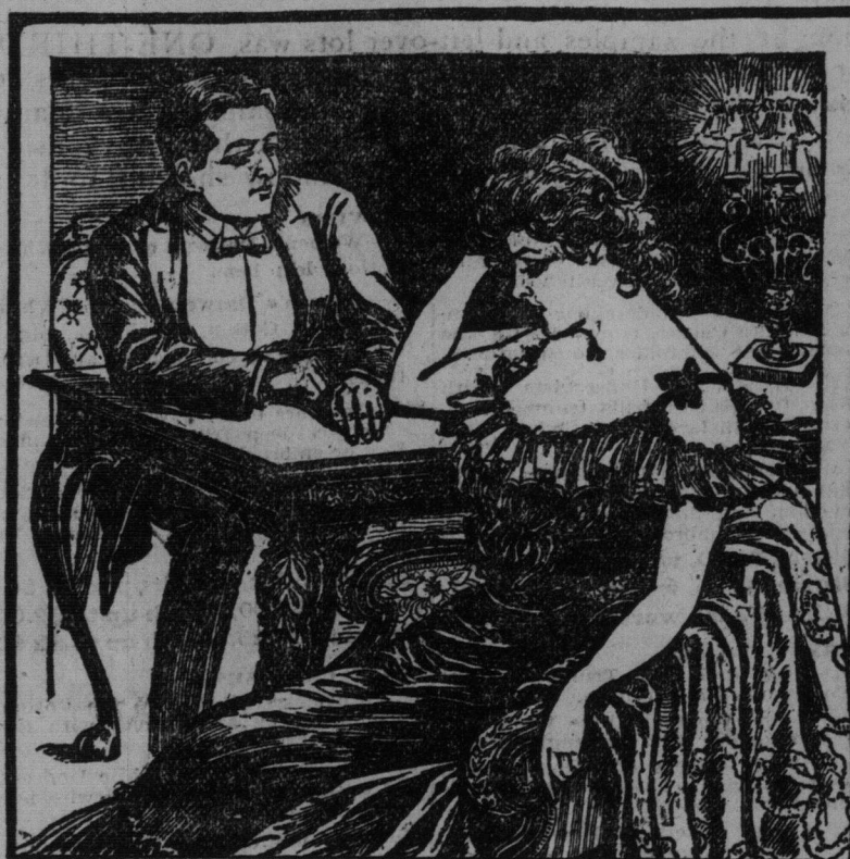
How Two Women Were Cured.

When a cheerful, brave, and light-hearted woman is suddenly plunged into that perfection of misery, the blues, it is a sad picture. It is usually this way: She has been feeling out of sorts for some time, experiencing severe headaches and backache; sleeps very poorly and is exceedingly nervous.