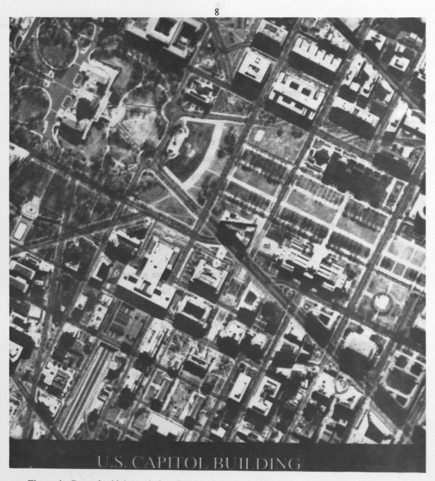
Figure 1. Recently high resolution Russian imagery has become commercially available. This KVR-1000 image of the Washington area has approximately two meter spatial resolution and has redefined the possible uses of commercial satellite imagery.