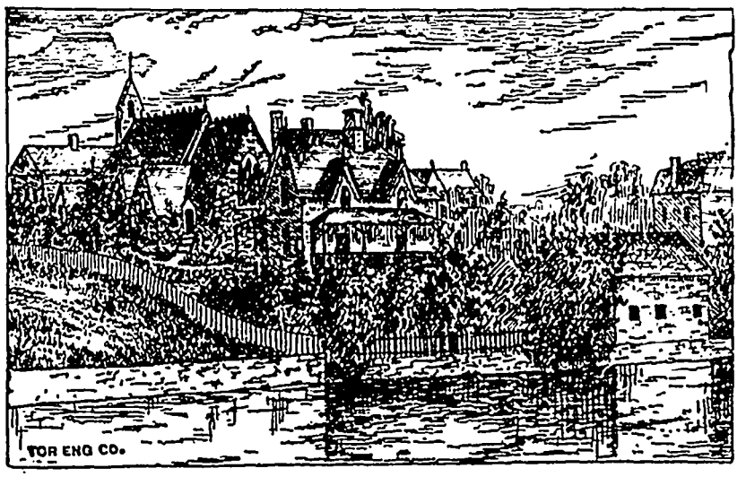
ST. PAUL'S CHURCH, ALMONTE.