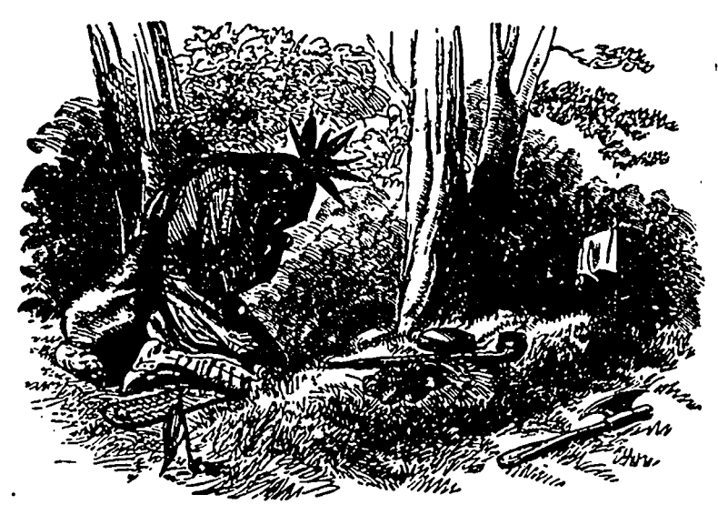
AN INDIAN'S GRIEF.

the school barber, and the assumption of civilized clothes, these little ones, who had never sat upon a chair before in their lives, or seen a table spread with a variety of food, would take rapid notes of the way knives, forks and napkins were manipulated, and it was seldom necessary to show them that sort of thing more than once.