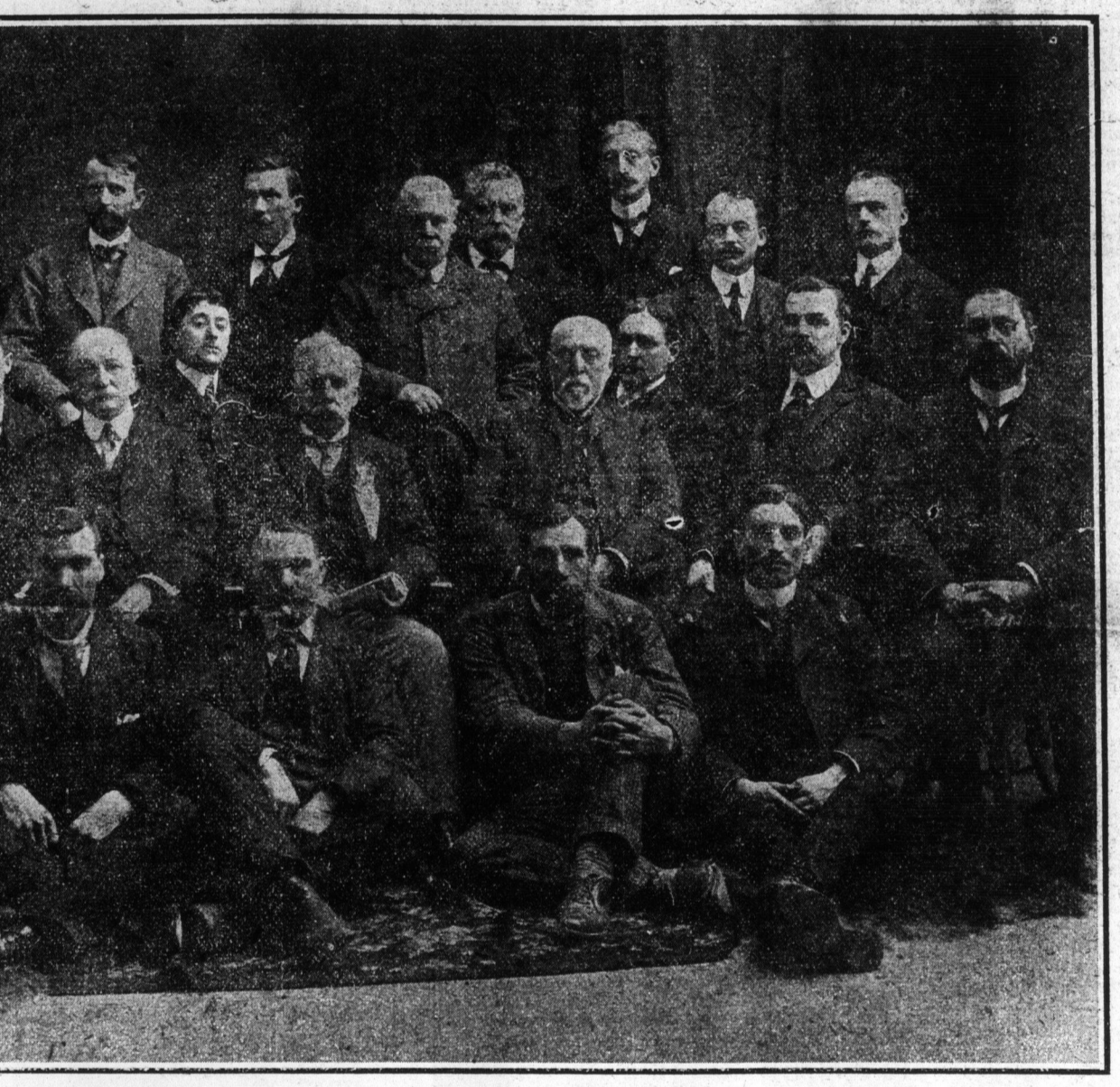
EXECUTIVE OF B. C. MINING ASSOCIATION.