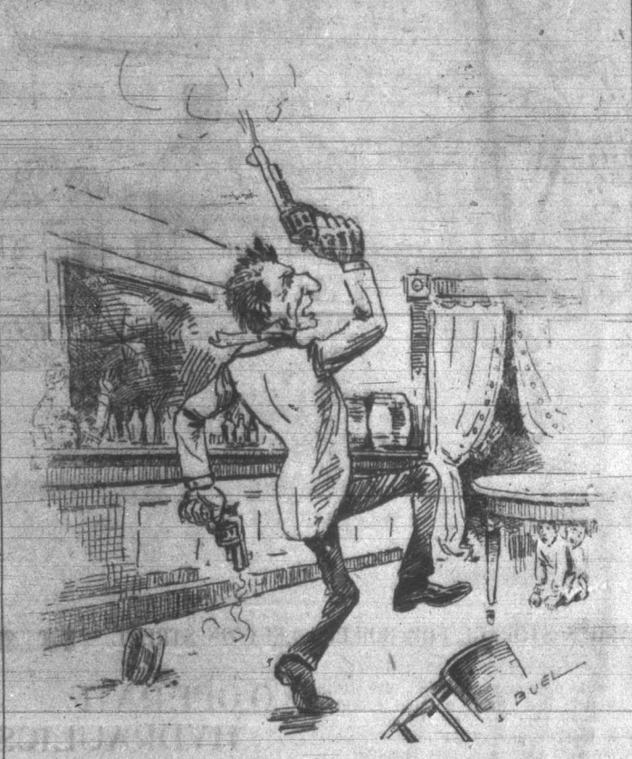
WHEN THE TRIBUNE EDITOR DONS WAR PAINT.