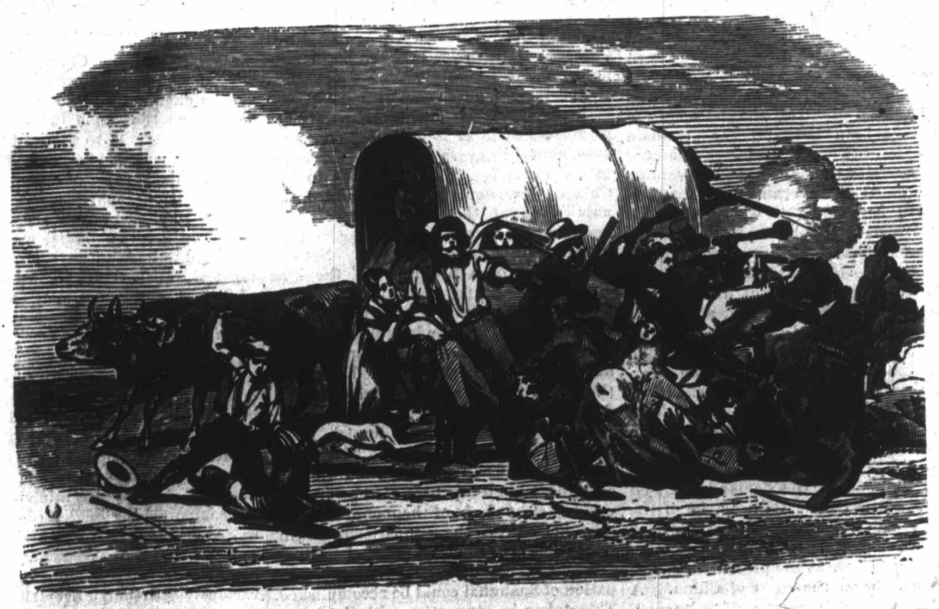
CROSSING THE PLAINS IN '60.