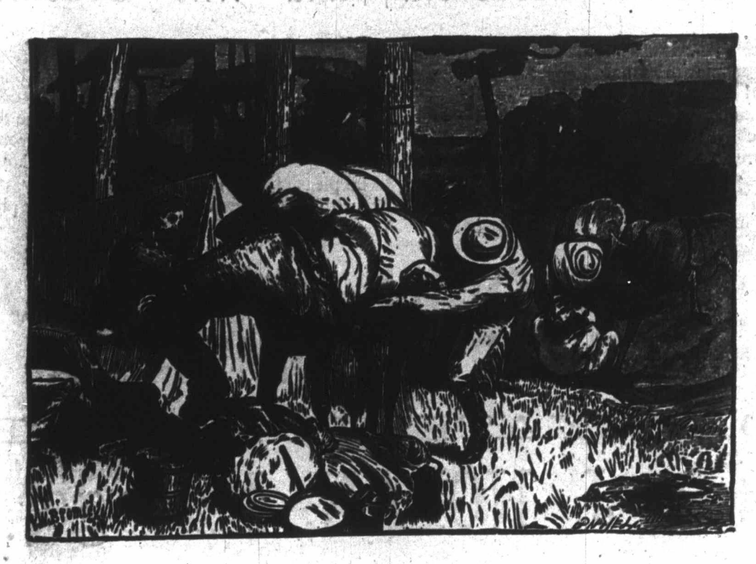
RAPID TRANSIT IN EARLY DAYS.