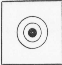
No. 1.—200 Yds. only.

Bull's Eye, 8 inches in diameter. Inner, 1 foot " " Magpie, 2 feet " " Outer, Remainder of Target 4 feet square.