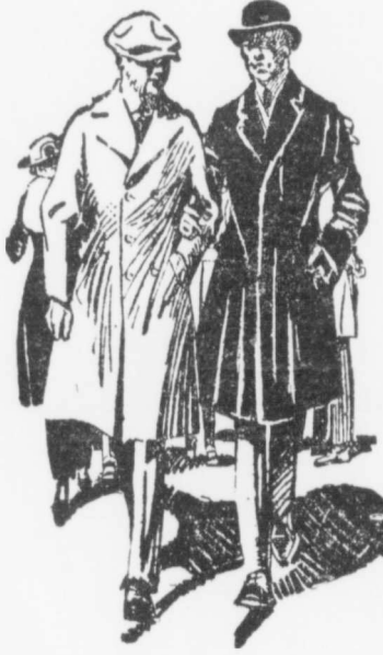
Let us Supply You Your Spring Needs

the little bit of "something better" that brought the championship to Ottawa.