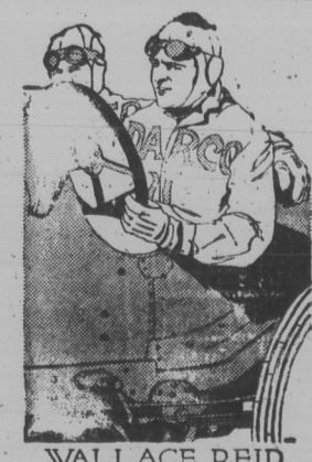
WALLACE REID "The Roaring Road"