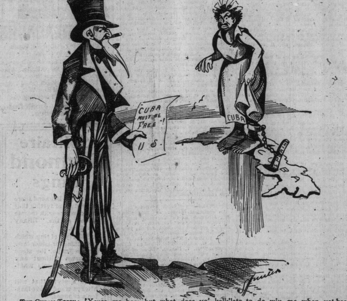
THE CUBAN TORSY: 'Excuse me, boss, but what does yo' kawk'late to do wiv me when yo' has mancipated me?'