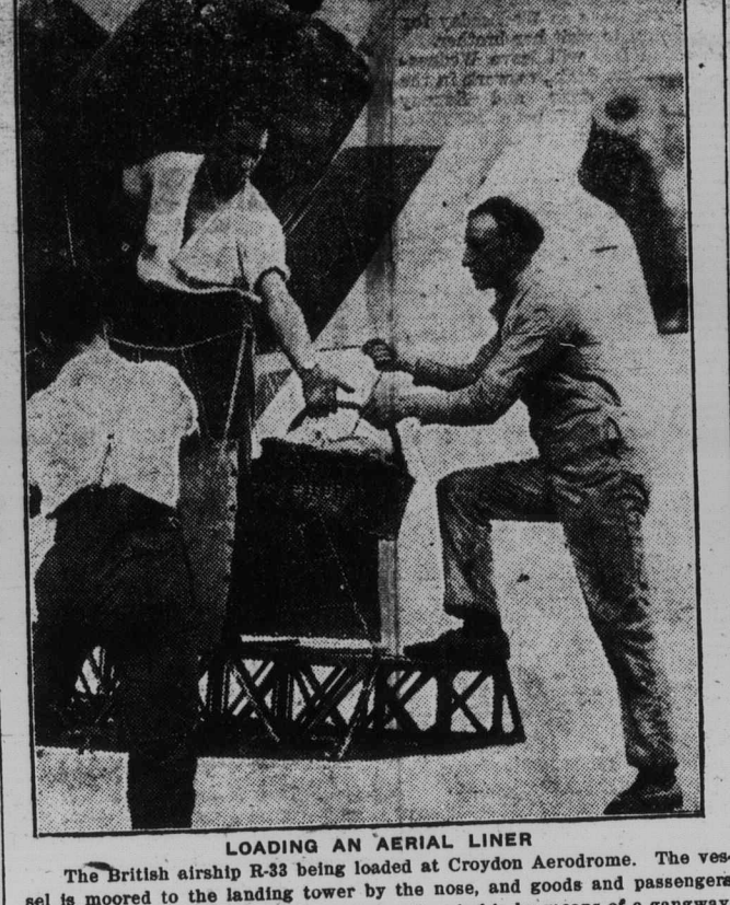
sel is moored to the landing tower by the nose, and goods and passengers are taken up through the tower and enter the airship by means of a gangway.