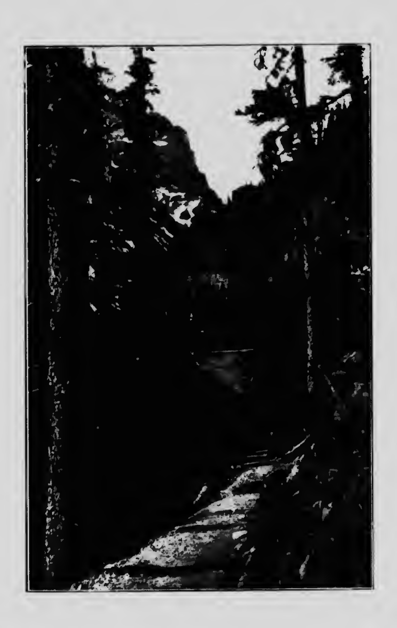
Far in the high north where scenery is grander, Kissed in the twilight by the frast and the dew; Great valleys ansazing and hillsides in splendor Are whispering old timer a welcame to you.