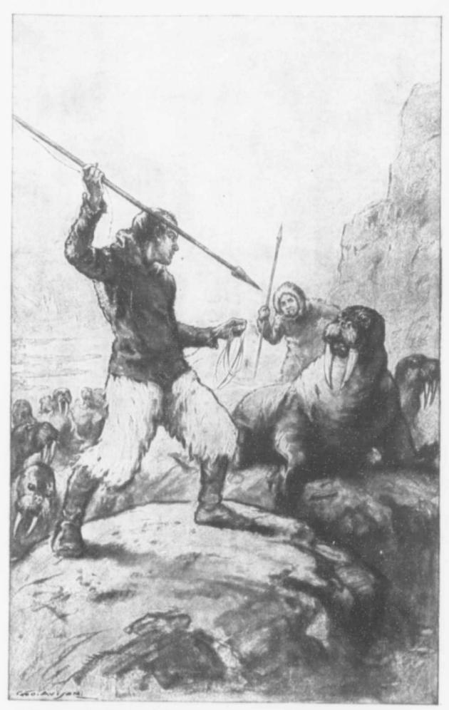
The great bull raised his grizzled head and bellowed a furious challenge \,