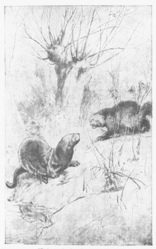
"It is nearly done," said Sachinnie