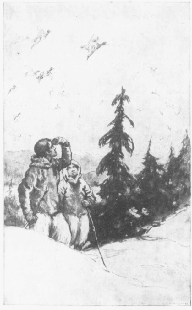
And then there were found great arrow-heads of ducks and geese with the wisest and strongest bird at the front