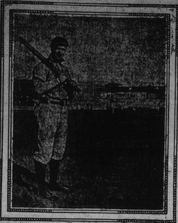
FRANK CHANCE, Known as Husk, leader of the Chicago champions.