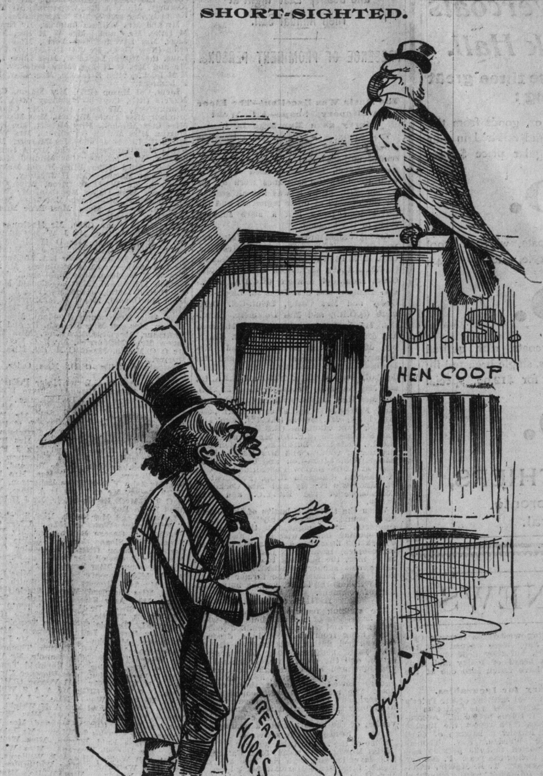
Deacon Laurier will find nothing in that coop for him—and he may go up against a bird that will cost him his political life.

TO CURE A COLD IN ONE DAY. Take Lassalle's Bromo Quinine Tablets. All druggists refund the money if it fails to cure. 25 cents.