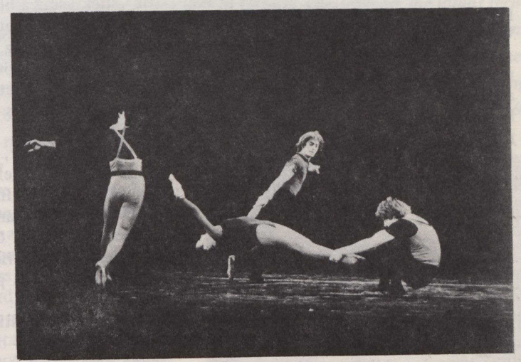
Entre-Six interprets Benjamin Britten's Toccata.