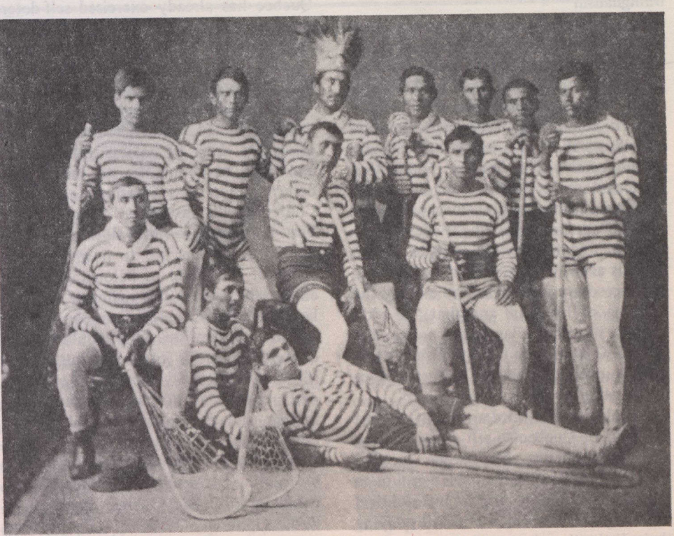
Caughnawaga Indian lacrosse team which toured Britain in 1876.

Box lacrosse (basically field lacrosse played in a closed space much like a hockey rink) emerged as late as 1932, when the Canadian Lacrosse Association