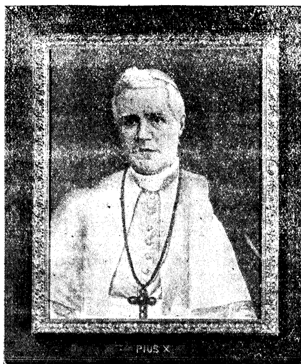
FREE FOR BLUE RIBBON COUPONS

Will first destroy the germs that excite the disease. Then there are numberless sore spots in the mucous membrane to be healed. Every requirement of a perfect cure for catarrh is found in fragrant healing Catarrhozone which not only instantly kills the germs but restores the diseased membranes to a normal condition and prevents the relapse which is sure to follow the use of ordinary remedies. Catarrhozone is a scientific cure for catarrh that relieves quicker, is more pleasant, most certain to cure than any other known remedy. Failure is impossible, lasting cure is guaranteed. Use only Catarrhozone. Two months treatment $1.00; trial 25c. Get it to-day.