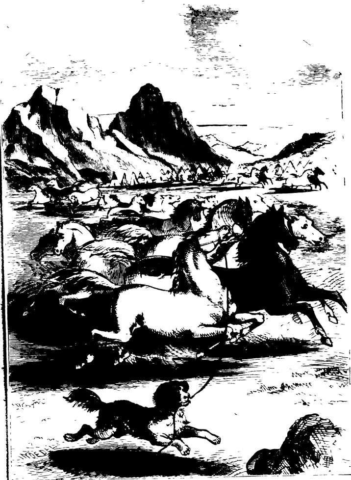
THE STAMPEDE OF WILD HORSES