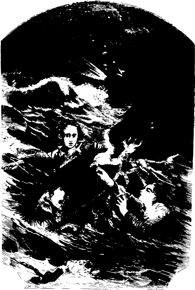
THE LIFE BOAT