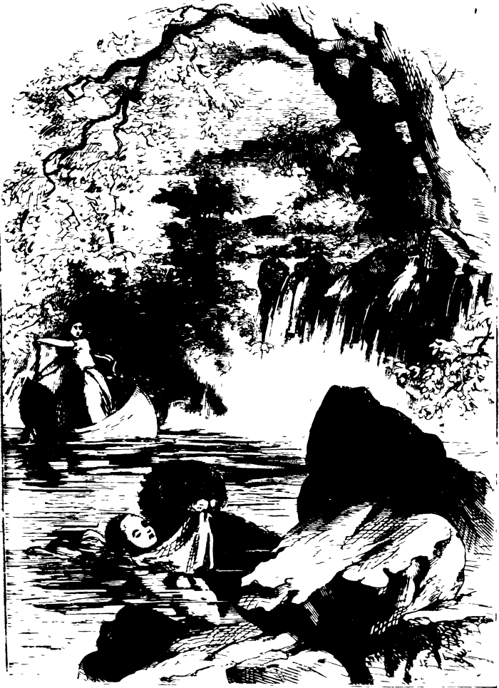
CRUSOE PROVES A FRIEND IN NEED