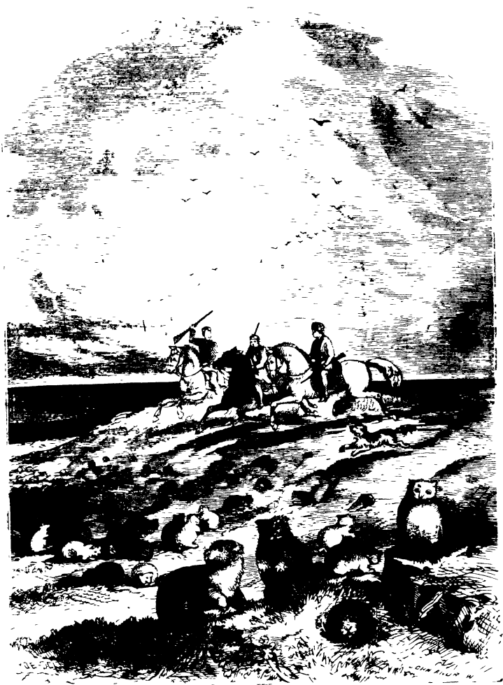
A COLONY OF PRAIRIE DOGS DISCOVERED