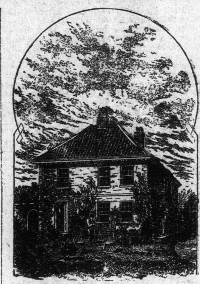
EPWORTH RECTORY, Where John Wesley was born, June 28, 1703.

The first organized form of Methodism was the United Society, established in 1729 in the disused foundry in Moorfields, which became the headquarters of Methodism until the City Road Chapel was built in 1773.