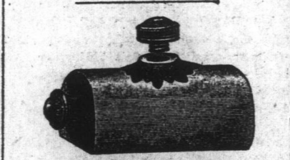
At STEELE'S from 90c. up.

MINCE PIE. I stood upon the coping of the tallest building known And tried to walk that dangerous ledge, barefooted and alone. I started very bravely, then I turned to look behind And saw a demon coming of the most ferocious kind; He bade me get a move on, and I started in to run And I slipped and lost my balance, and I knew that I was done. I had a wild encounter with a mad and awful beast. His eyes were bulged with malice, for he'd pick me for a feast. I tried to scream, but couldn't. Then he growled a fearful note And gave one spring towards me and his fangs sank in my throat. One gulp and it was over—it was much too black to see. But I knew beyond all question that end had come for me. I tumbled from an aeroplane and looped and looped around. And was twenty-seven minutes on my Journey to the ground; I bumped a dozen steeples on my perilous descent And left as many flagstaffs either snapped off or bent— But when I woke, in terror, I discovered with a sigh How much of real excitement lurks in mother's hot mince pie.