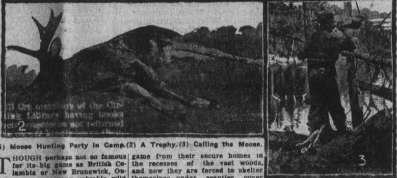
(1) Moose Hunting Party in Camp. (2) A Trophy. (3) Calling the Moose.

THOUGH perhaps not so famous for its big game as British Columbia or New Brunswick, Ontario possesses many valuable wild animals, which the hunter loves to pursue in the fall and early winter. None of the game of this province is more interesting than the moose. He is to be found in many haunts, but his favorite resorts seem to be in the Timagami district, around Desbarats, Bisson, Missanable, and White River, and is often to be seen in the region stretching from Fort William to Wabigoon Lake. This season the hunters in Northern Ontario are sure to have an exceptionally good time, for the great forest fires that have recently occurred there have driven the big