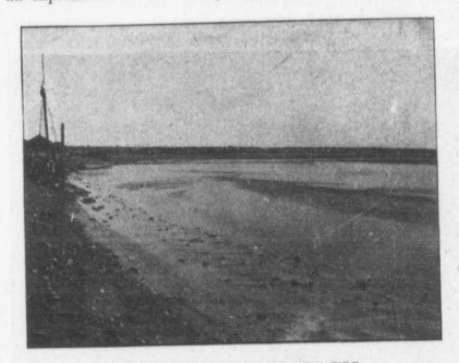
THE PETICODIAC RIVER, AT LOW TIDE.

"O a visitor from Ontario one of the most interesting features of the Maritime Provinces is the action of the tides. If he arrives first at St. John, N.B., he will be surprised to see vessels of various kinds, at the city wharf, lying helplessly in the mud, away below the street Possibly he may reveal his greenness by asking for lovel an explanation of the strange sight, and he is kindly in-