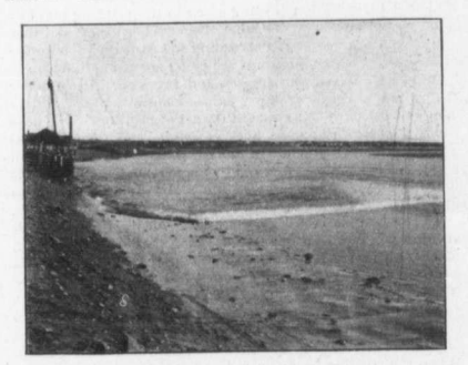
THE TIDAL BORE, PETICODIAC RIVER.

The two most remarkable vagaries of the tide are the famous "Reversible Falls" at St. John, of which we have