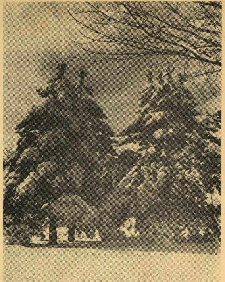
Gazette Photo by Richter Data—Taken with a Birk and James 4x5 on TRI-X film; 1/100 sec at F:18; K2 filter.