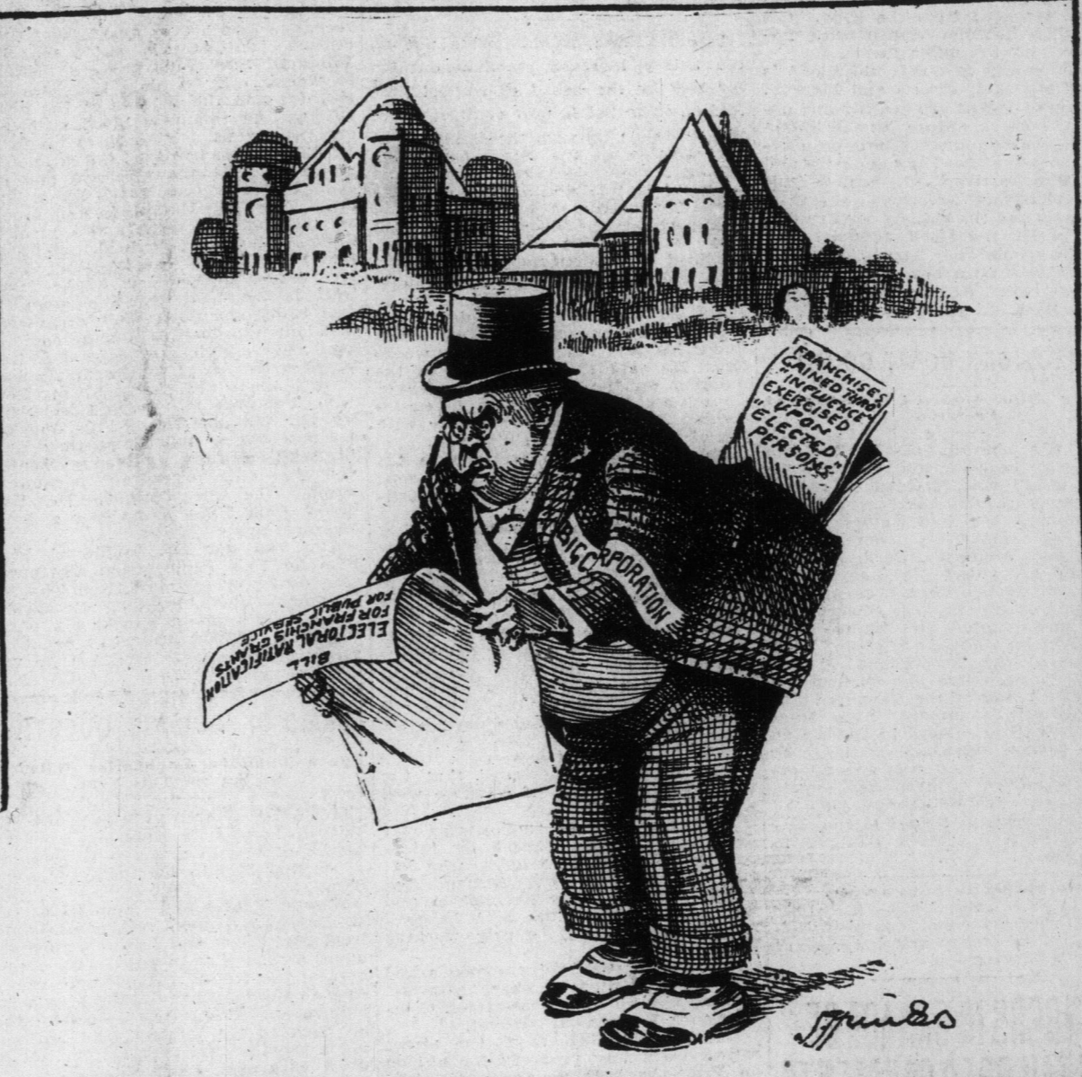
Big Corporationist: "Ha! That looks like a dastardly blow at The Big Wad."

TERMS ASKED BY C.N.R. FOR SUBURRY EXTENSION 7500 Acres of Land and $3000 Cash Per Mile "Very Reasonable," Mackenzie's Opinion. "We think that would be very reasonable assistance."