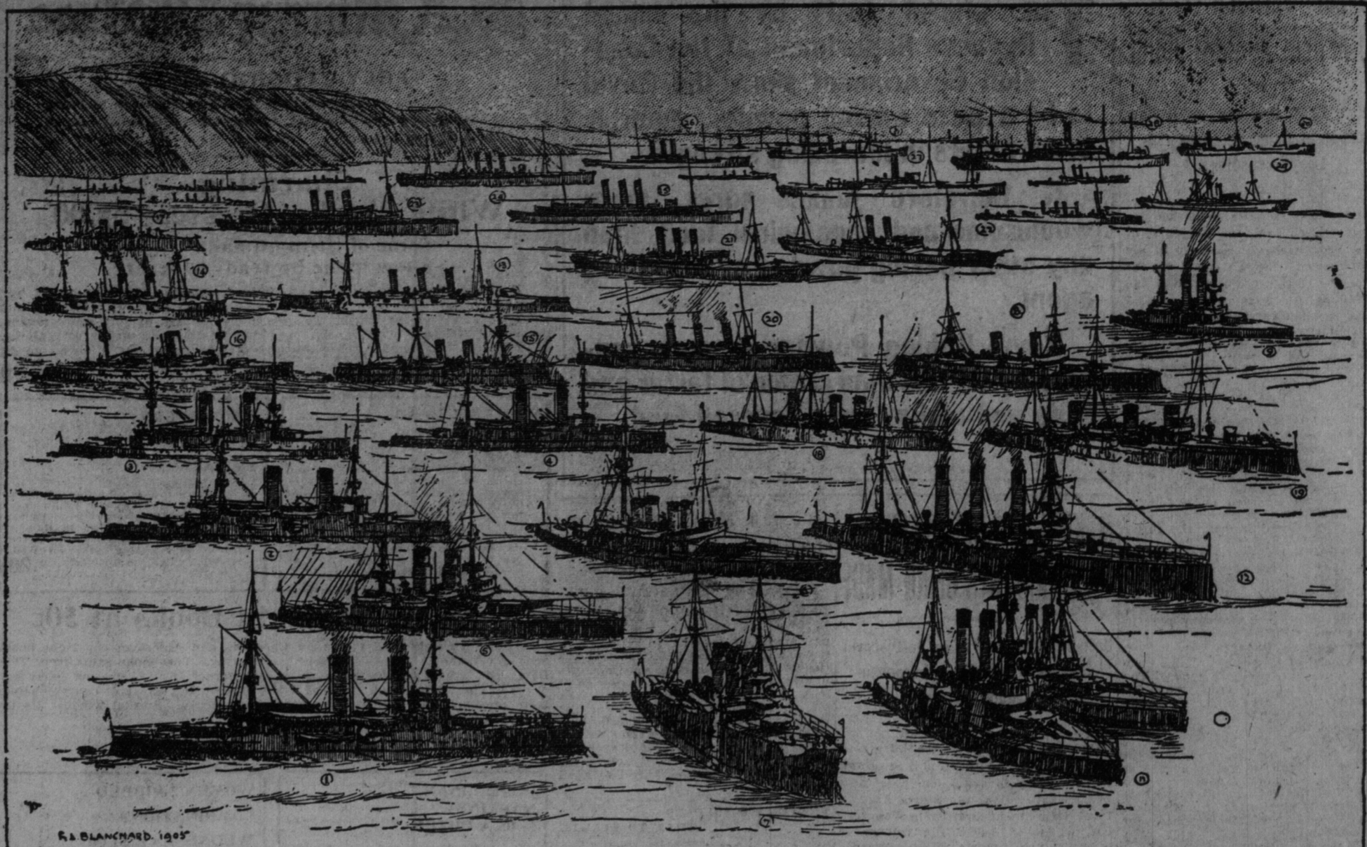
1 Kuzaf Suraroff, 2 Borodino, 3 Orel, 4 Alexander III, 5 Sissoi Veliki, 6 Navarin, 7 Oshlaba, 8 Nicolai I, 9 Admiral Apraxine, 10 Admiral Orel, 11 Admiral Ushakov, 12 Aurora, 13 Oleg, 14 Vladimir Monomach, 15 Dmitri Donoski, 16 Admiral Nakhimoff, 17 Almaaz, 18 Jemchug, 19 Izumrud, 20 Svetlana, 21 Rion, 22 Dnieper, 23 Don, 24 Perak, 25 Ural, 26 Kuban, 27 Anadyr, 28 Irtish, 29 Orel (Hospital ship), 30 Graf Stroganoff (Tank steamer), 31 Kamschatka (Repair ship).