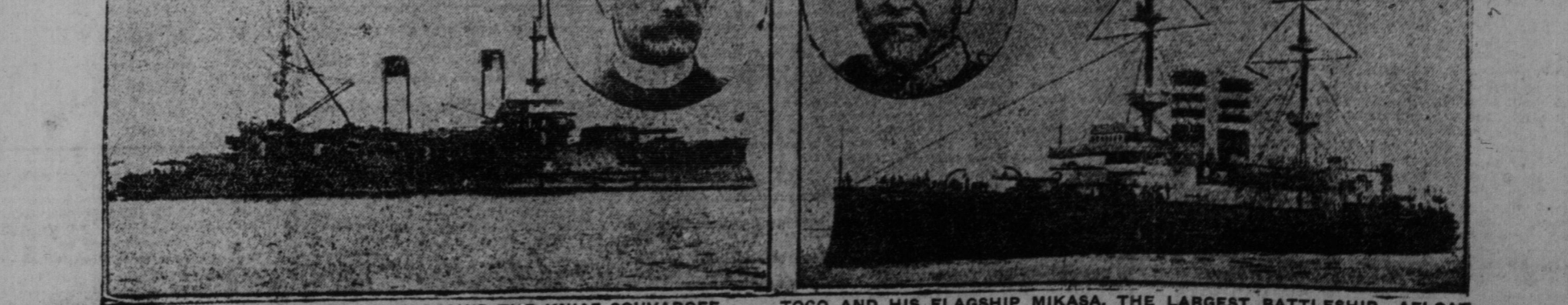
ROJESTVENSKY AND HIS FLAGSHIP THE KNAZ SOUVAROFF. TOGO AND HIS FLAGSHIP MIKASA, THE LARGEST BATTLESHIP AFLOAT.