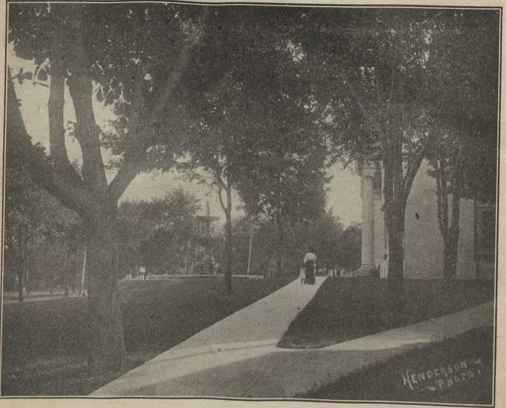
SCENE AT COURT HOUSE, KINGSTON.