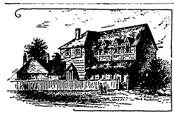
QUEEN'S COLLEGE, ST. JOHN'S, NEWFOUNDLAND. (See page 270).