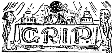
AN INDEPENDENT POLITICAL AND SATIRICAL JOURNAL