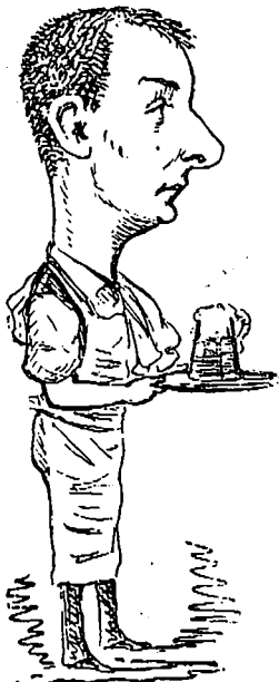
John Halifax, Gentleman.

That Safe Topic—The Weather. Scene.—King Street; Time.—Tuesday Afternoon. Dramatis Personæ.— Editor Mail and editor Globe. They meet. Ed. Mail. —Beastly weather, isn't it? Ed. Globe. —Glorious, I call it! Good and Gritty! Sort o' Northumberland and Carleton blizzard—makes you fellows bite the dust, hey? Exit chuckling.