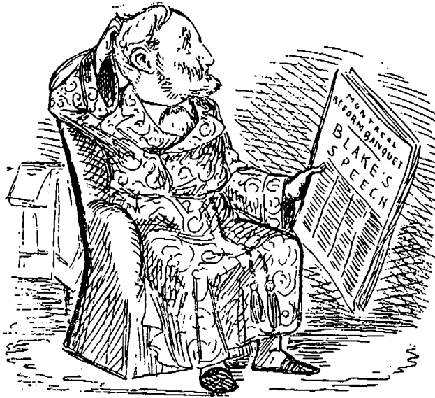
"A Disturbing Speech."