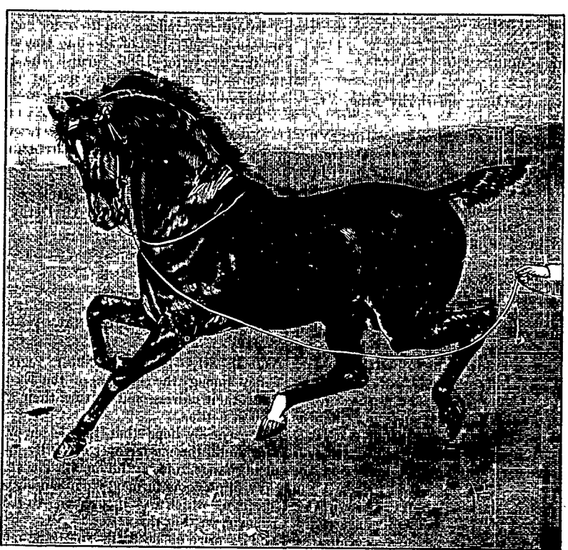
CHAMPION HACKNEY STALLION CANDIDATE.

upon the value of the manure for his profit. Now, what is this manure good for? simply to be returned to the land whence it came, minus some very valuable constituents which have been taken from it by the cattle during the time of their laying on flesh and fat, plus, let us say, some nitrogen which the leaves of the growing plants may have extracted from the air. Now if this is the case, why not plough in a crop of green clover and be done with it, and save a $30.00 a head loss on the 16 steers, which is not an unfair estimate if we take his first figures and add the items of interest, taxes, rent, wear and tear of buildings and machinery, now think this over and let me know how you view the