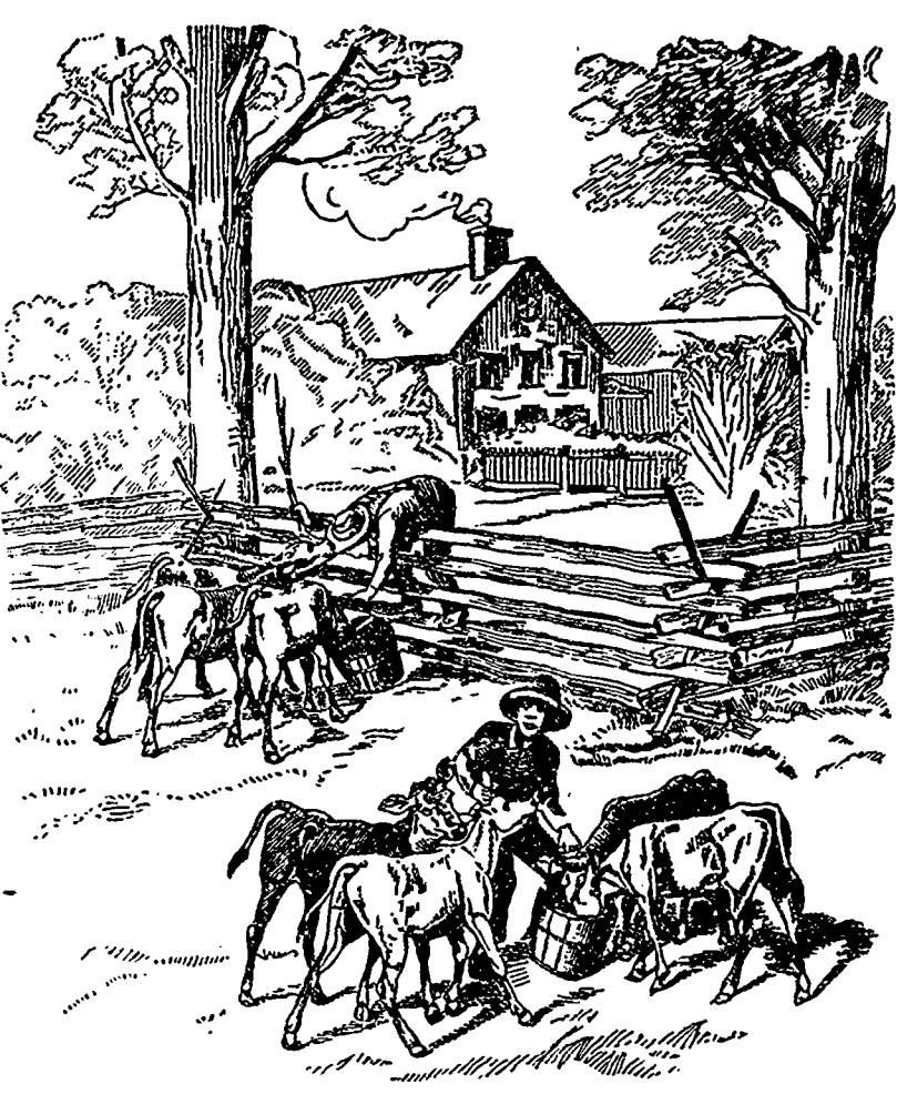
THE DARK SIDE OF CALF FEEDING. Fig. 2.