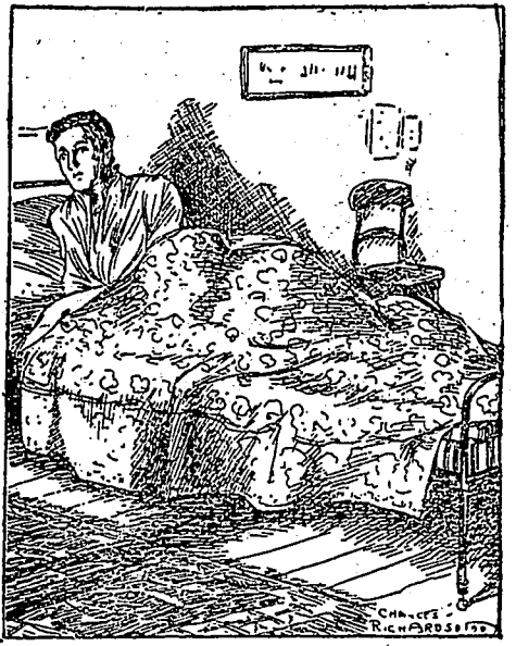
'DOCTOR,' HE SAID, 'YOU MUST DO SOMETHING FOR ME.

It was a very weary time for his mother, and for a while it seemed that death was very near, but youth and strength. combined with all that human skill could do, triumphed over disease, and he passed the crisis safely. At last the day came when he could sit up in bed propped up by pillows, and talk of his great ambition and his longdelayed plans. He watched his mother