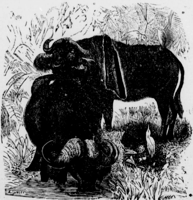
CAPE BUFFALO.—( Bubalus Caffer. )

I FEEL convinced that every man has given him of God much more than he has any idea of, and that he can help on the world's work more than he knows of. What we want is, the single eye that we may see what our work is, the humility to accept it; however lowly, the faith to do it for God, the perseverance to go on till death.— Norman McLeod.