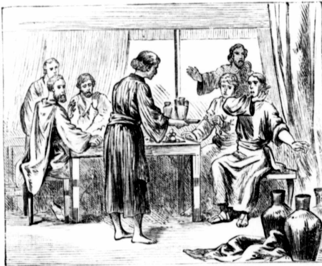
THE FAITHFUL RECHABITES.

from famine, because the enemy so closely watched the city that no provisions could be brought in. After eighteen months the city was taken. The king and his sons were taken prisoners; and the last sight his eyes beheld was the saddest a father could behold: it was the murder of all his sons, after which his own eyes were put out, and he was taken away to the great city of Babylon. The palace and all the great houses were burned, and the beautiful temple was robbed of all its vessels. The enemy had no compassion on the people. They were either killed or taken away captives, only the very poorest of the people were left as vine-dressers and husbandmen. Thus you learn that God's threats, like His promises, will surely be fulfilled. Remember that all the trouble, and sorrow, and ruin, and death, was the wages of sin; and it is just the same now. "The wages of sin is death." Read Prov. 29: 1.