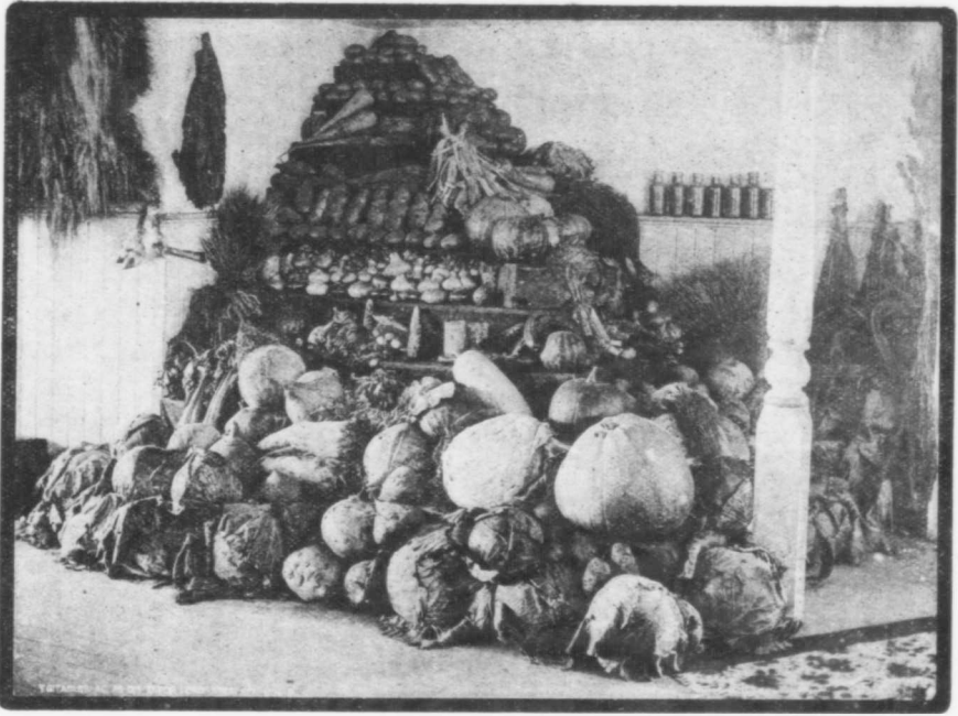
VEGETABLES EXHIBIT AT EDMONTON AGRICULTURAL SOCIETY'S MEETING.