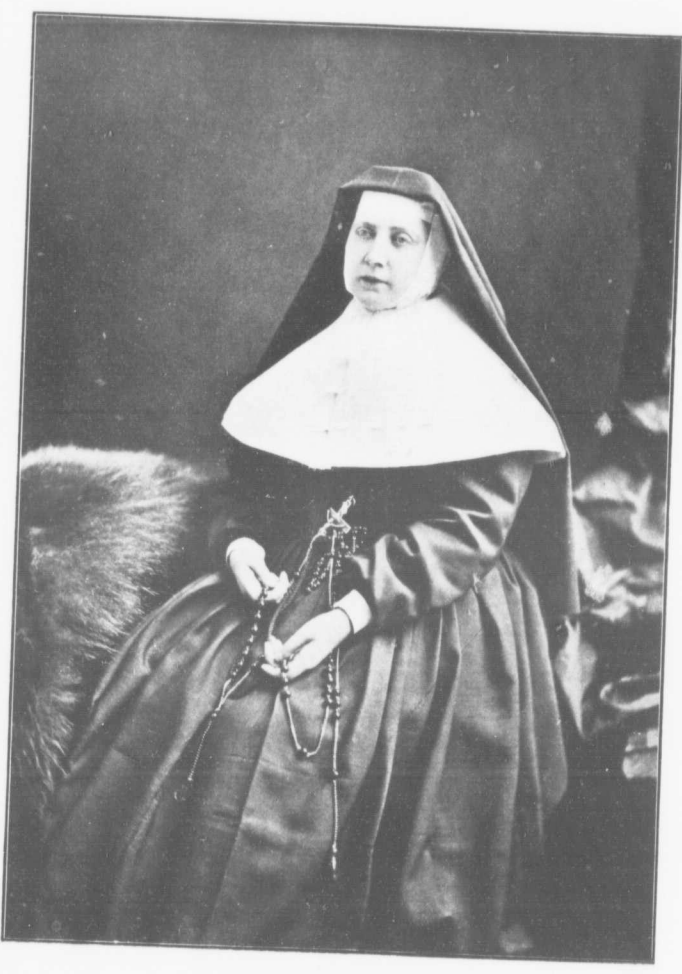
12 foullying &