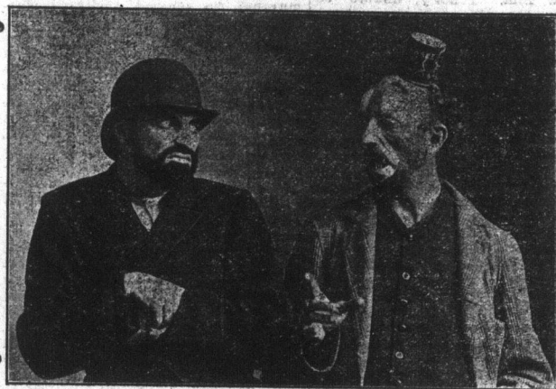
Comedians with the Roland Stock Company

The admission fees are low, being only ten, twenty and thirty cents, for the evening performance, while at the matinee on Saturday afternoon, children will be admitted for five cents, and adults for ten. On Thursday evening ladies will be admitted free if accompanied by a friend holding one paid ticket.