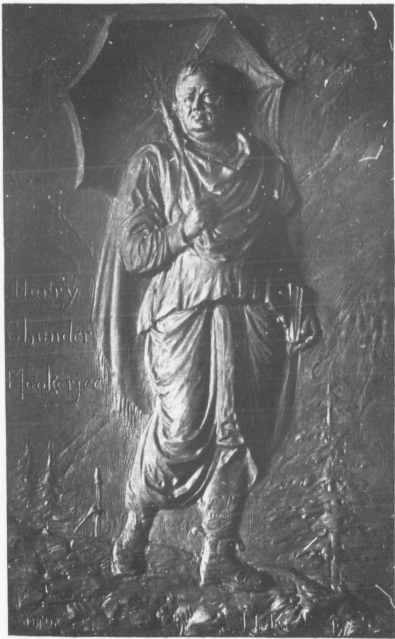
"Full-flecked, heavy-haunched, bull-necked, and deep-voiced."