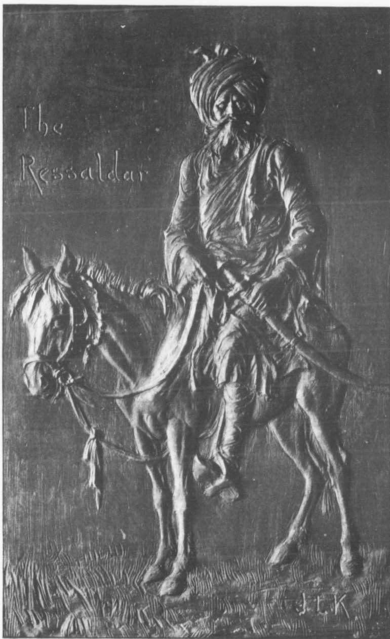
"He sat long-legged on the little beast, with the big sword at his side—hand dropped on the pommel—staring fiercely over the flat Lands . . ."