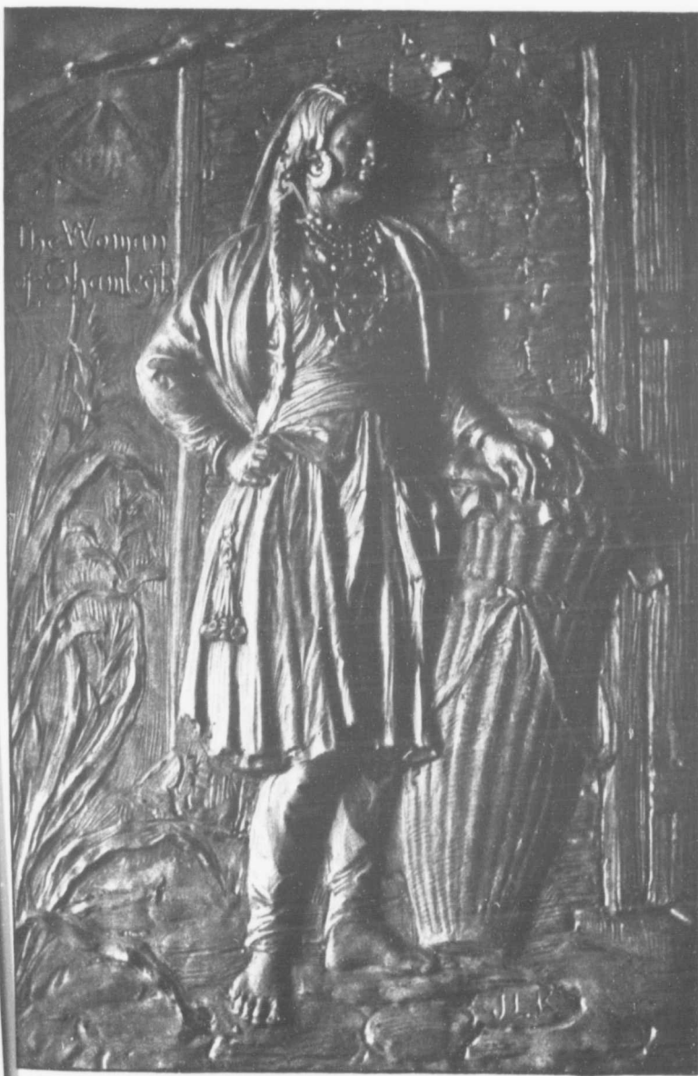
"I am the woman of Shamlegh."