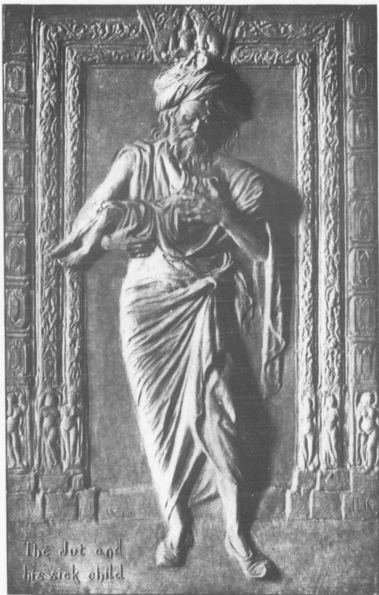
The Jot and his sick child

“They are all most holy and—most greedy . . . I have walked the pillars and trodden the temples till my feet are flayed, and the child is no whit better.”