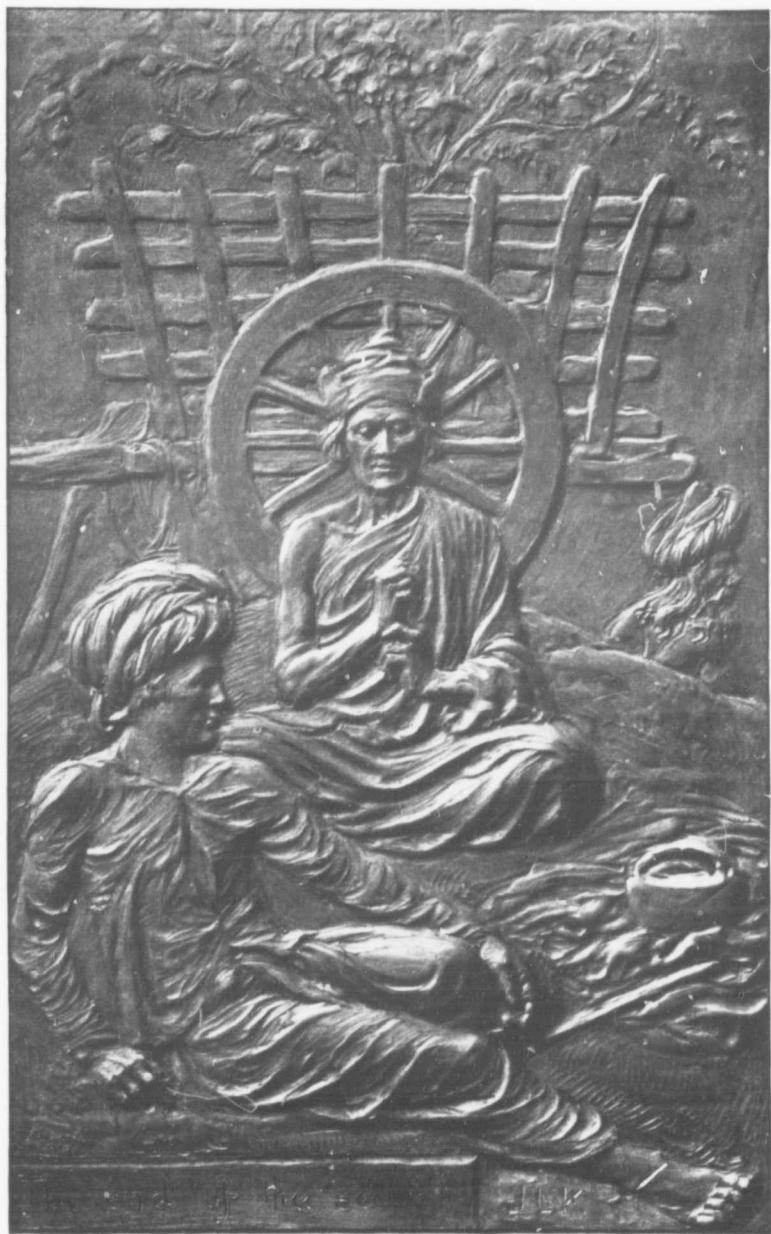
"He crossed his hands on his lap and smiled, as a man who has won salvation for himself and his beloved."