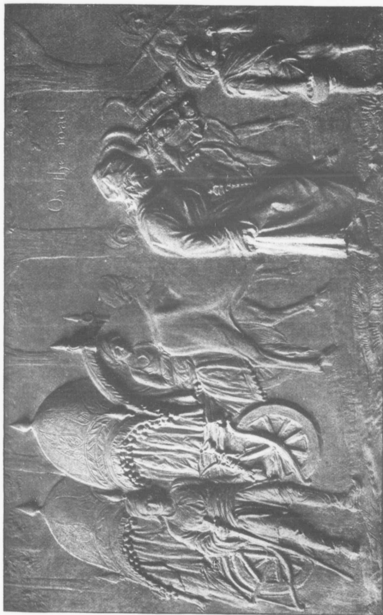
"The Lama and Kim walked a little to one side; Kim chewing his stick of sugar-cane, and making way for no one under the status of a priest."