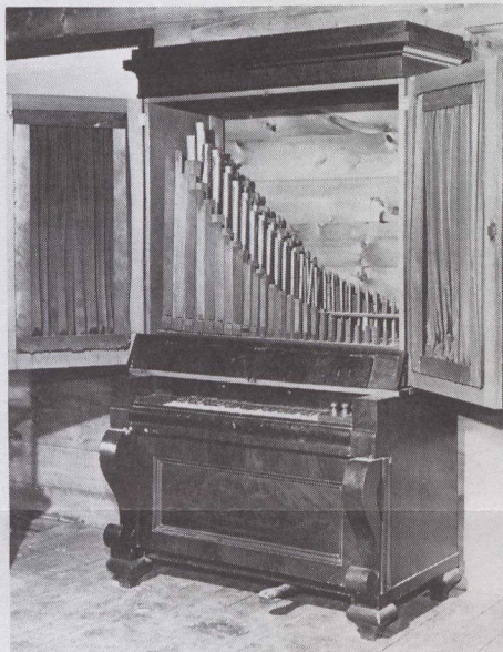
Pipe organ built about 1830.

The organ building trade in Canada started only in the nineteenth century. A barrel from one of the two barrel organs constructed by Richard Coates (1778-