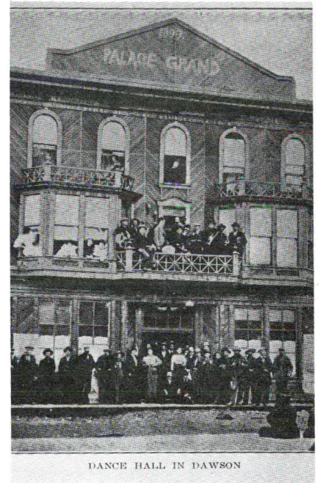
DANCE HALL IN DAWSON

The curtain falls and the applause fades to a scraping and shifting of old-style straight-backed chairs as the patrons of the Palace Grand rise to leave. Most, if not all, will repair directly to Diamond Tooth Gertie's, Dawson's (and Canada's) only legal gambling casino.