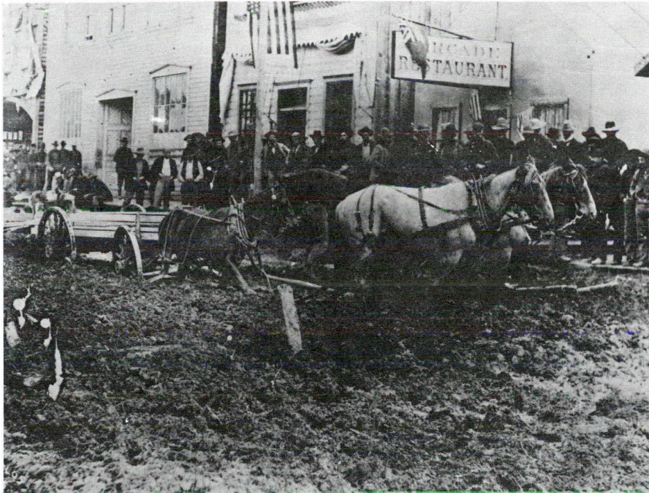
Dawson City's Front Street was like a river of mud when the Yukon River

overflowed its banks in the spring breakup of 1898.