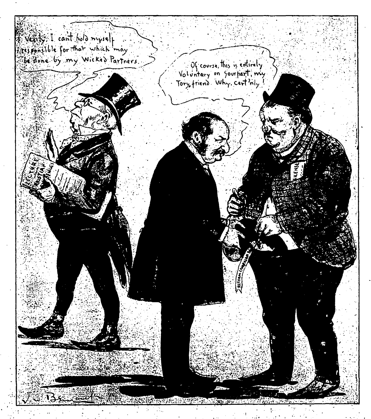
OLIVER THE GOOD AND HIS WICKED PARTNER.