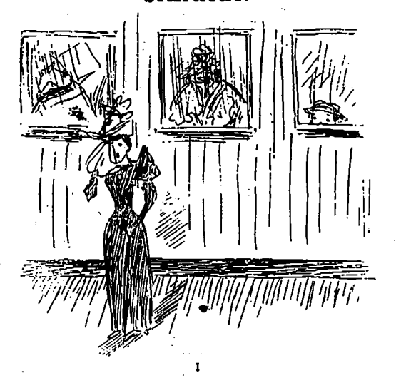
Mrs. X. on leaving Toronto has a tearful parting from her daughter at the Union Station