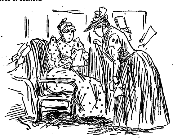
She does so. "And have you too been parting from a beloved daughter, my friend," she begins, through a mist of tears. "No, ma'am," answers the stranger, looking up. "I've got dretful sore eyes, that's all."

Her sympathy is aroused by the spectacle of another weeping woman in the train, and a fellow-feeling prompts her to approach with words of comfort.