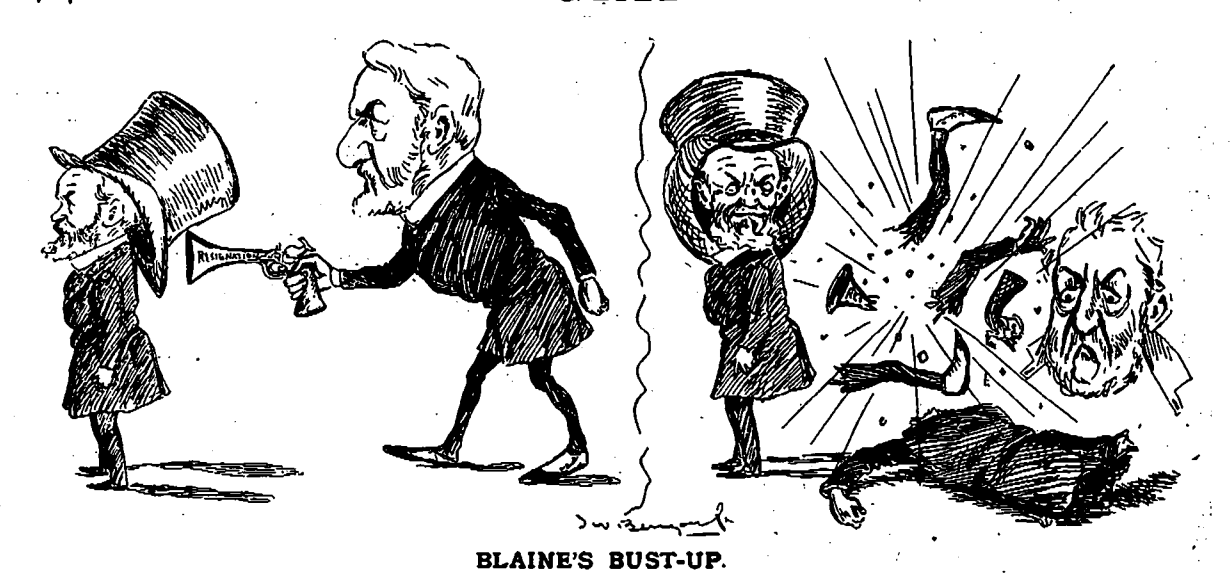
Sad catastrophe to a Magnetic Statesman while attempting to carry out an act of Treachery.