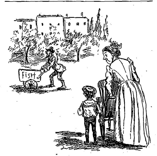
A CONTRADICTORY CRY.

Quebec is considering the taxation of mortgages. The heavenborn statesmen who are advocating the idea are going to take for public uses part of the usurer's exactions from the borrower. That's what they think. The money-lender just smiles and familiarizes himself with the column of the interest table represented by the addition of the per cent. tax to the current interest rate. The rider who took the bag of flour from before the saddle and carried it on his shoulder, "to relieve the hoss," ought to be Finance Minister in the De Boucherville Government.