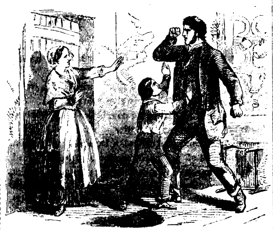
For the Sunday-School Advocate.

undressed, laid tenderly in bed, and the old family ple by their looks. You would do well to learn the same lesson. Some people are better and some worse than they appear. We must not form hasty judgments.