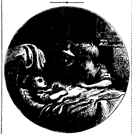
For the Sunday-School Advocate.