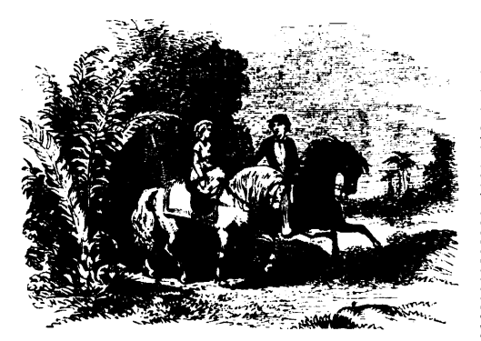
For the Sunday-School Advocate.