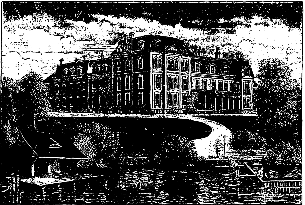
BISHOP RIDLEY COLLEGE.

The Principal has been successful in maintaining an excellent staff of nine teachers, to whose exertions the reputation of the school is due. Pupils have been prepared every year for admission to the Universities, for entrance to the Medical profession, and for admission to the Schools of Science, with uniform success. But the efforts of the staff are not alone directed towards success in the class-room. Every one of the masters plays cricket and other games, care being thus taken to overlook the conduct and language of the boys while at play, as well as during work hours. The College grounds afford opportunity for more varied amusements than those of any other school in the Province. There is a fine gymnasium, a cricket field of over seven acres; and on the home ground five tennis courts and a large open hockey and skating rink. Through the property there runs the old Welland canal, very seldom used by vessels, and now almost a private river. On its banks are erected a commodious boat-house, where the boys keep canoes and skiffs, and a large swimming-bath, where boys are taught to swim, and where they enjoy a daily bath in summer. Swimming races form one of the features of the summer sports.