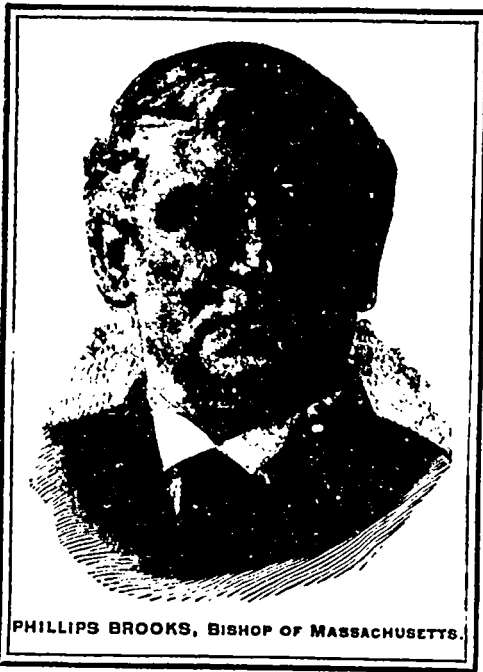
PHILLIPS BROOKS, BISHOP OF MASSACHUSETTS.