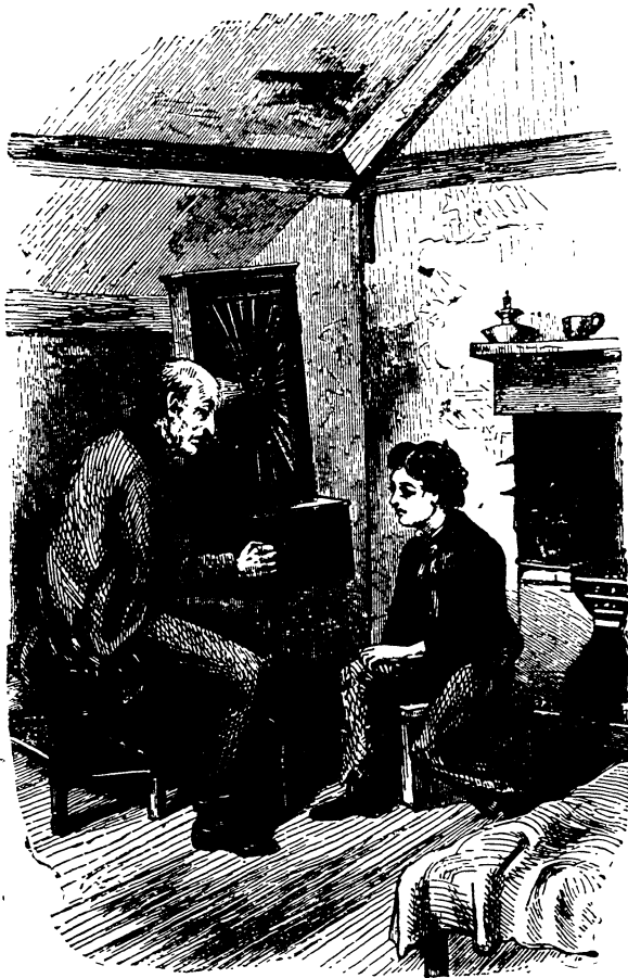
·OLD TREFFY PLAYS A TUNE.