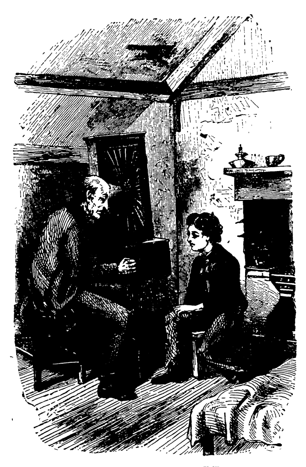
OLD TREFFY PLAYS A TUNE.