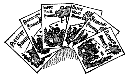
SET NO. I CONTAINS 2 EACH OF

Fully illustrated. 16mo, cloth, decorated covers: each, 20c.; boxed sets of 12, $2.40