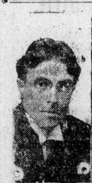
H. L. RANN.

The fly is an agile and prolific insect with four feet and one of the most industrious stingers known to profane history. It is looked upon as a pest and pursued with ceaseless energy by people clad in night and day.