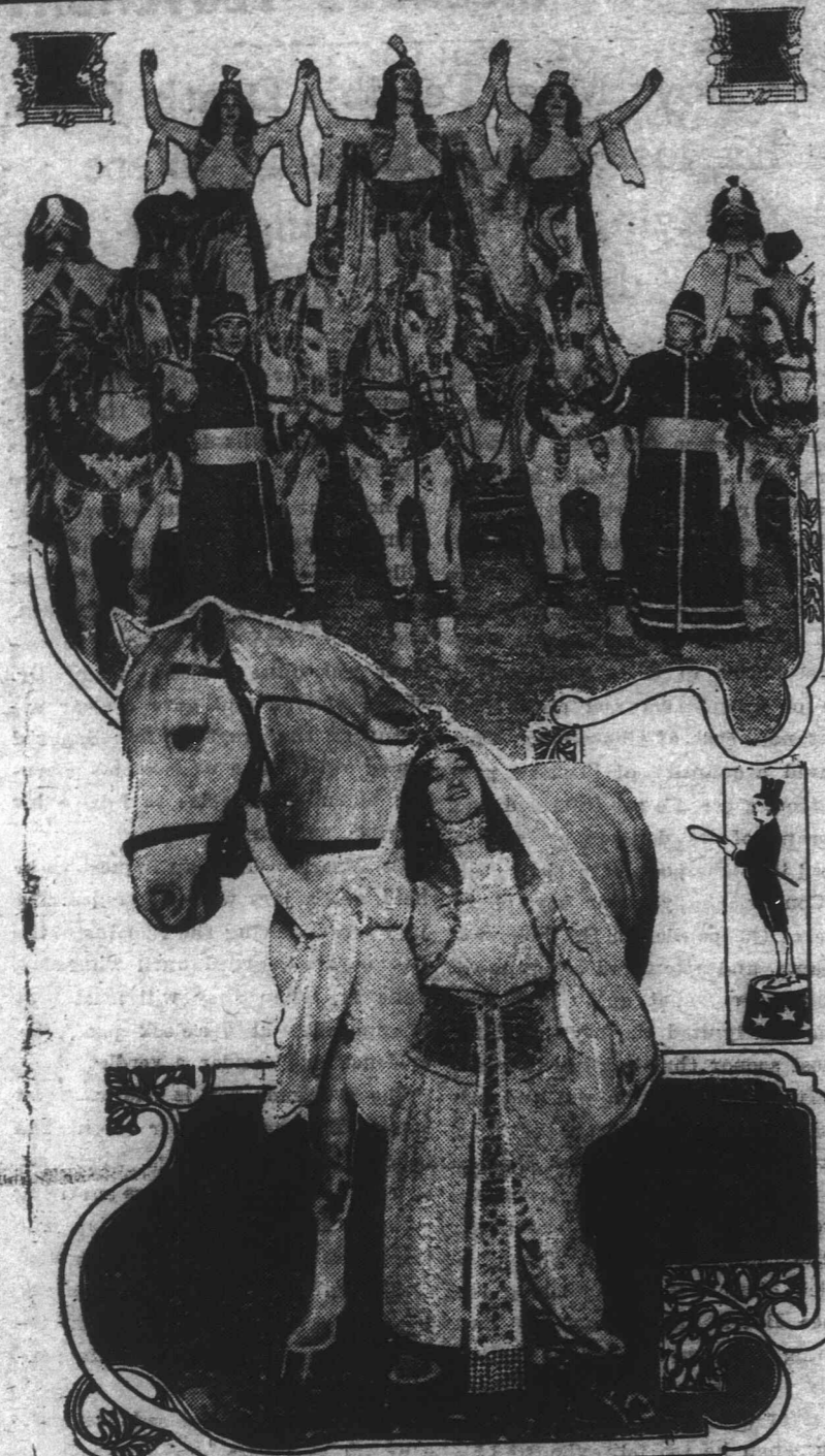
Men and Women from the Balkan Mountains Coming Here With Ringling Bros.