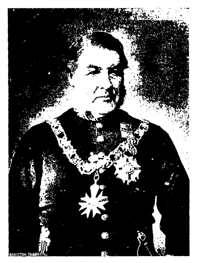
SIR CHARLES TUPPER, BART.