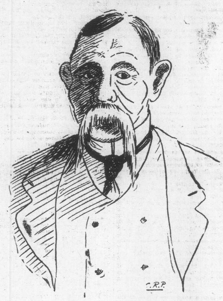
The Member for Okanagan, the Man who has put up a strenuous fight for the Midway and Vernon Road.

and the excessive taxation imposed by it necessary to float a loan of $1,000,000 this government. The minister of finance when in opposition had made a strong plea in favor of collecting taxes from the E. & N. But there was nothing said