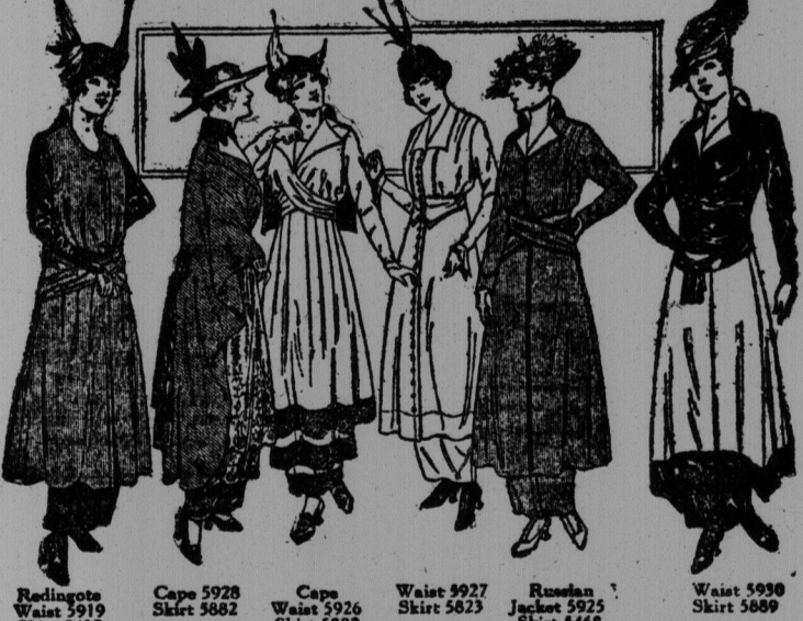
Never before has such a splendid collection of novelties been offered to your stomach. Be sure to see them before deciding on your FALL STYLES. The Most Wonderful Collection of AUTUMN STYLES comprising the latest RUSSIAN TUNIC, BASQUE SPANISH CAVALIER CAPE WAIST etc., etc., has just arrived. OCTOBER PATTERNS AND MAGAZINES NOW ON SALE