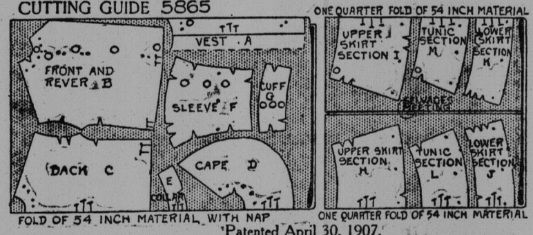
Pictorial Review dress, No. 5865. Sizes 8, 10, 12 and 14, years. Price, 15 cents.

Patterns published in this series may be obtained by sending price of pattern in cash or stamps to Pictorial Review, 25 Carleton Street, St. John, N. B. As a rule it takes about one week to deliver the pattern to the buyer. Those sending money must be careful (1) to write the number of the pattern plainly; (2) to write their name and post office address clearly; and (3) to enclose the price.