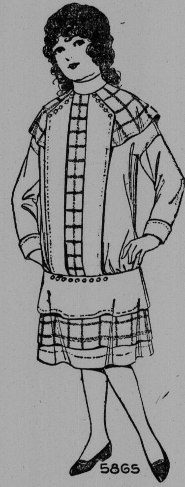
Smart model for a school girl's dress, made with a shoulder cape and vest of plaid silk, combined with blue serge.

Prepared Especially for This Newspaper by Pictorial Review