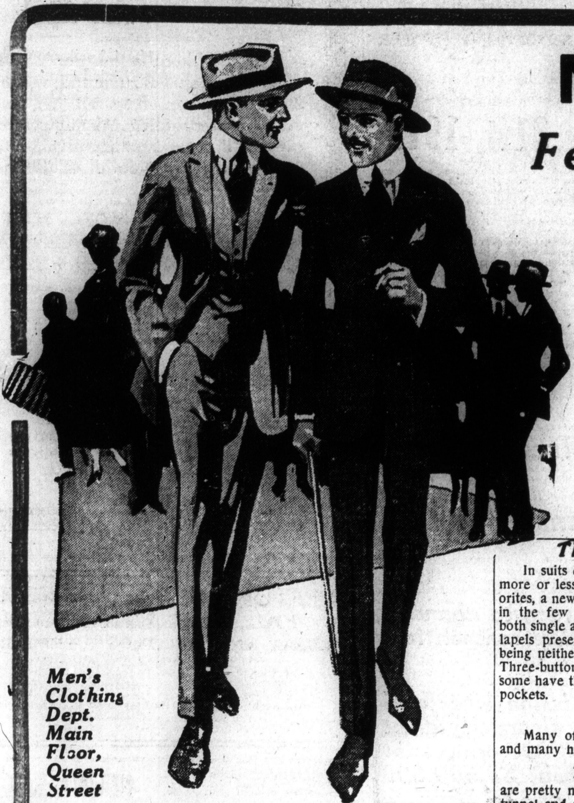
Men's Clothing Dept. Main Floor, Queen Street

At both Yonge Street and Queen Street doors are order boxes where orders or instructions may be placed. These boxes are emptied daily at 8.30 a.m., 10 a.m., 1 p.m. and 4 p.m.