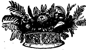
ILLUSTRATION TO VOL. LII